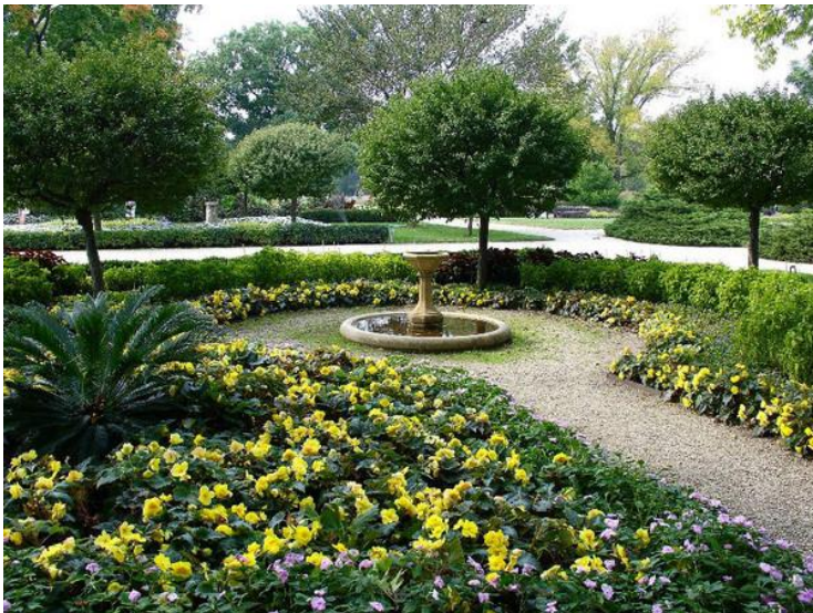
One of many beautiful garden displays at Boerner Botanical Gardens, this one featuring a fountain.

The group keeps busy as each year they offer a full complement of nature driven student, adult and family classes and events at Boerner Botanical Gardens, both indoors and outdoors. Over the course of 2012, FBBG delivered plant science & environmental learning to over 17,000 K12 students – largely public school, a 6% increase from 2011.