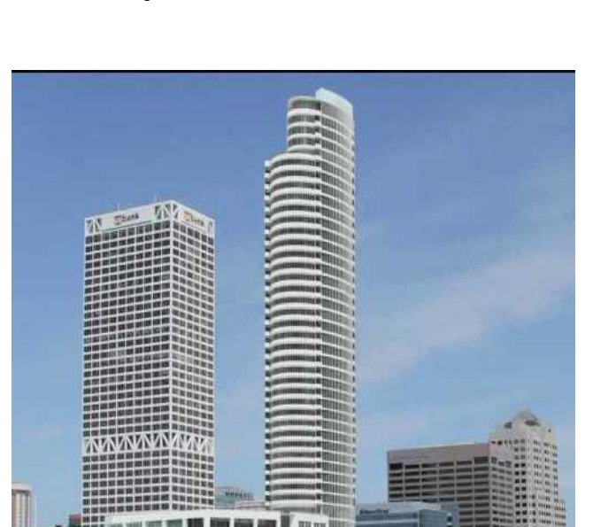
Artist rendering of the proposed project

That is why it was disappointing to to previous see that, contrary discussions, the item involving the Downtown Transit Center redevelopment was not included on the agenda for the Economic and Community Development Committee meeting on July 16th particularly in light of the overwhelmingly positive response from local leaders and the broader community.