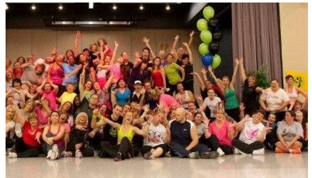
"Mayor's Fitness Challenge" participants posing after an intense "Zumbaton" work out session.