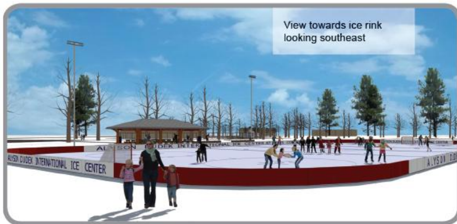
View towards ice rink looking southeast

Members of the Friends group and local officials met this idea with enthusiasm, and efforts are underway to make this great idea a reality. The proposed Alyson Dudek International Ice Center will benefit future athletes as they pursue their dreams, and will bring back the fun of family recreational skating, as well as other community uses.