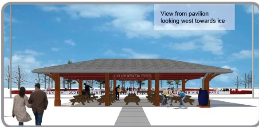
View from pavilion looking west towards ice